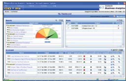
Performance Management Dash Board