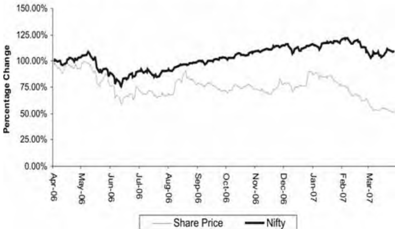
Relative Performance of Ramco Systems Share Price with NSE NIFTY