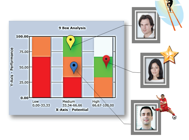
Fig. 1.A good Performance Management software should enable you to develop your talent map.

Performance Management does not start with setting up Key Result Indicators at the beginning of the appraisal cycle; nor does it end with arriving at the final performance ratings and subsequent bonus rates. The true beginning of Performance Management starts with an understanding of how business goals are translated to each employee's key result indicators.